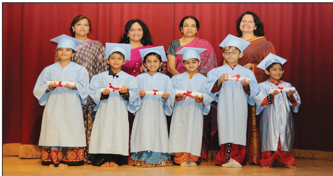
First grade Graduates of 2012

For additional information, please visit www.davmschool.com or call (281) 759-3286.